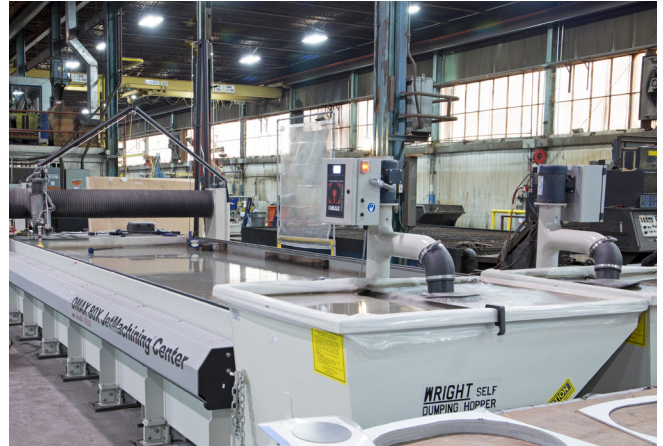
Omax - WaterJet