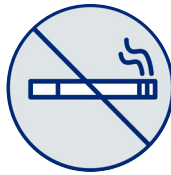
Know What is Prohibited