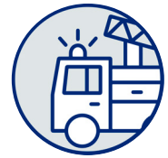
Know What to Do in an Emergency