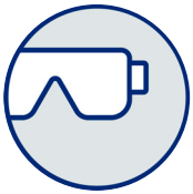
Dress for Safety