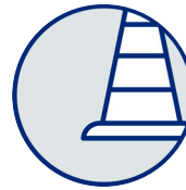
Watch for Hazards