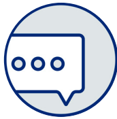
Know our Mobile Phone Policy